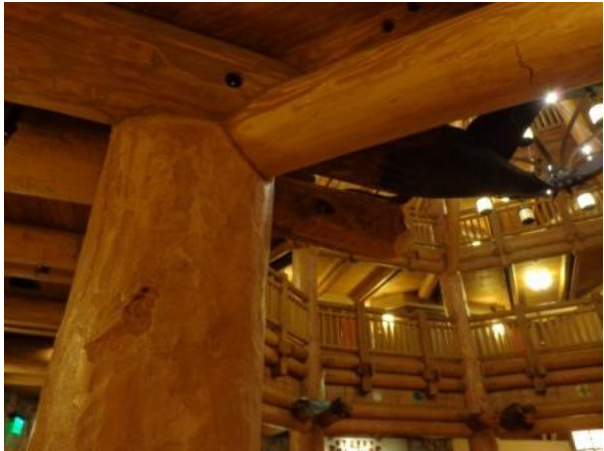
Here's the beam