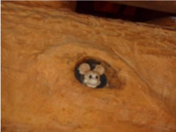
Here's the Mickey