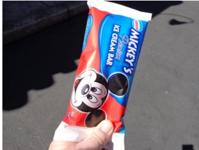
This is a rare picture of a Mickey Bar in my possession still in its wrapper.

After my ride on RRC, it was ice cream time. NHshorty wanted a strawberry cone and I was hankering for a Mickey Bar.